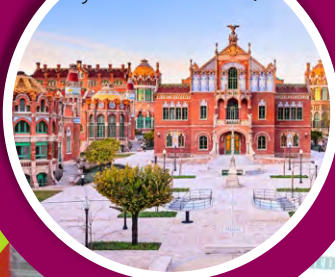
Sant Pau Art Nouveau Site