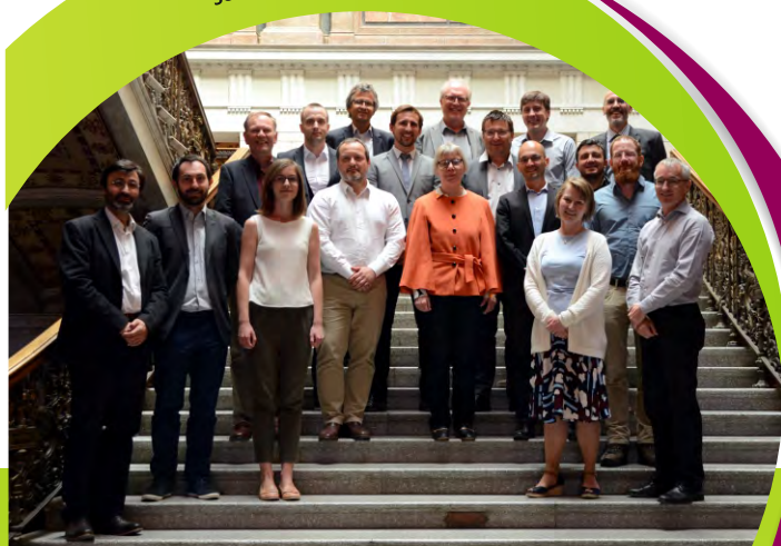
SCAR SWG Bioeconomy