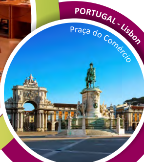
PORTUGAL - Lisbon Praça do Comércio